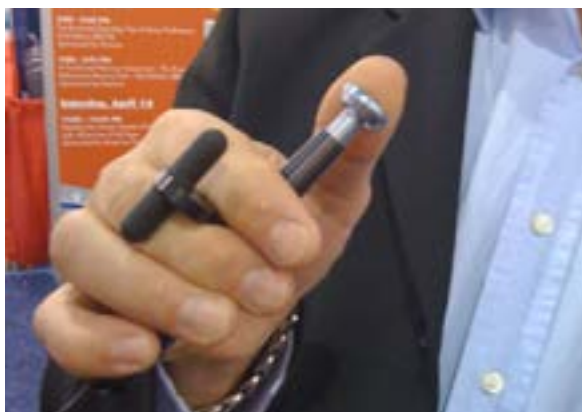
Examples of push-pat hand controls and under-ring, over-ring and thumb operated accelerators with hand operated brakes