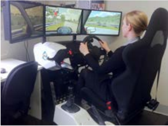
Driving simulators can contribute to OT driver assessment

Health professionals should maintain an awareness of any changes in health care and technology and any relevant evidence based practice that may affect their assessment of drivers. For example, this may include advances in prosthetic technology, intelligent vehicle technologies, driving simulators or computer based screening and rehabilitation tools.