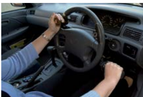
Examples of hand operated brake with 'over-ring' and 'thumb operated' accelerator and hand operated brake/accelerator with steering aid.