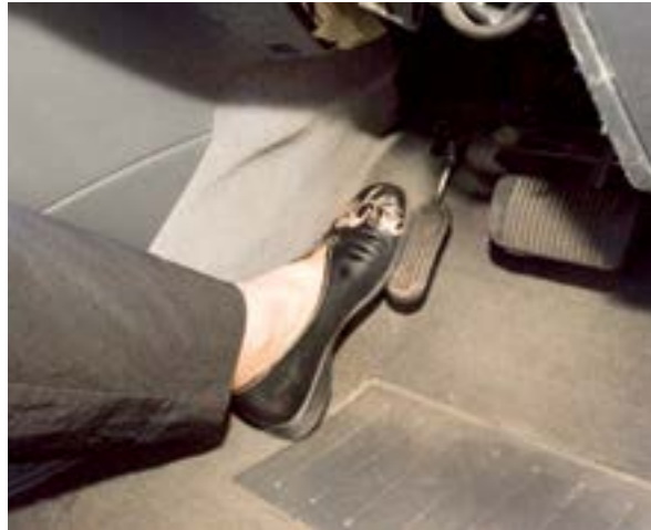
Left foot accelerator