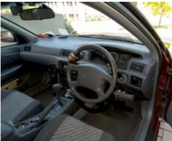
Hand controls with steering aid