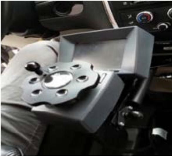
Example of alternative steering system