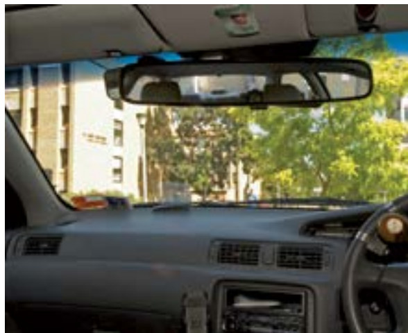
Over sized mirror

Some examples include 'spinner' or steering aids applied to the steering wheel, left foot accelerator pedals (pedal repositioned on the left side of the driver foot compartment), hand controls (as an alternative to foot controls if a driver can't use or doesn't have lower limbs) and special/additional mirrors. Some driving aids or modifications can only be fitted in a vehicle with automatic transmission.