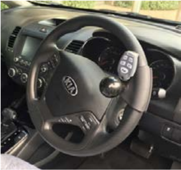
Steering aid with integrated secondary controls

Safe vehicle control including steering control is the primary concern. The client should demonstrate full range of movement of the steering wheel when only using one upper limb. Adaptive equipment such as an indicator extension or integration of frequently used secondary vehicle controls into a steering aid/device (e.g. indicators, horn) may be required.