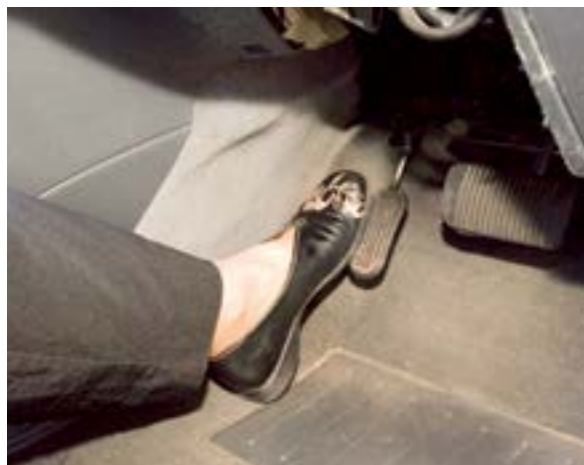
Left foot accelerator pedal

It is recommended that a person who has no use of their right leg and does not wear a prosthesis or the prosthesis manufacturer has specified that the prosthesis is inappropriate for driving, should drive a vehicle with automatic transmission and an accelerator fitted to the left of the brake pedal for left foot operation. As an alternative, a hand operated accelerator is acceptable.