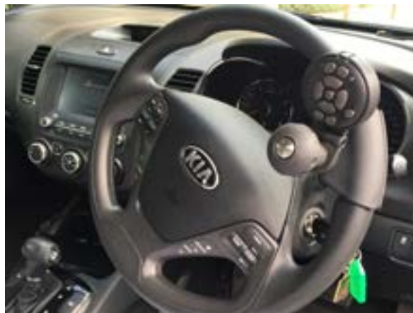
Steering aid with integrated secondary controls