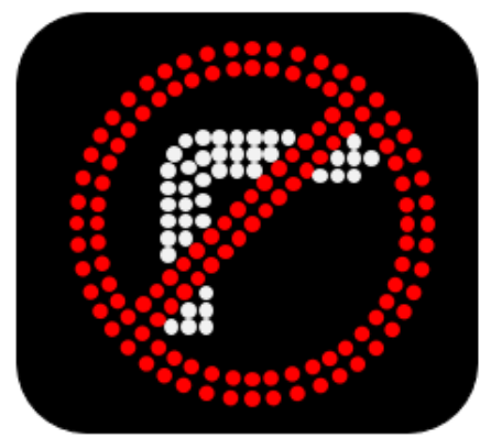
Figure 4.1 - Sign fully ON during flash cycle