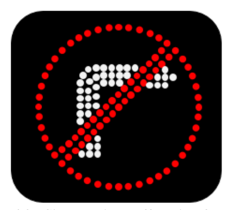
Figure 4.2 - Sign partially off during flash cycle