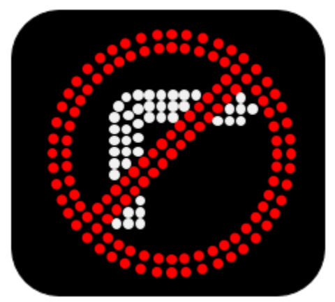
No Right Turn Sign Layout

The sign's arrow shall consist of three-pixel rows of LEDs while the annulus shall consist of two LED pixel rings with 12.5mm spacing, as shown in Figures 3.1 and 3.2.