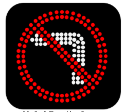
No Left Turn Sign Layout